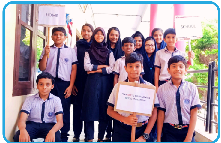
Spreading awareness against Child Labour

Elites of NPS stood together in eradicating child labour by exhibiting captivating diversions to thought provoking realms on 12th of June. Presenting an intriguing insightful skit on the relevance of educating children, Class VI B students spread an awareness on Child labour. Placards and slogans reflected 'Nothing is costlier than a missed opportunity' made each learner to think on their opportunity and blessings. The younger ones instilled to raise voice against the denial of education at any instance.