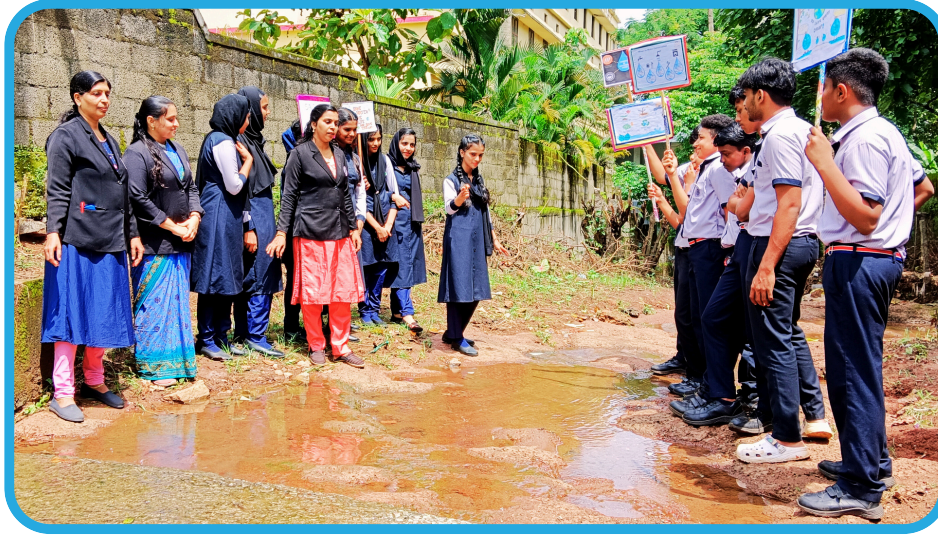
Students on Save Water Venture