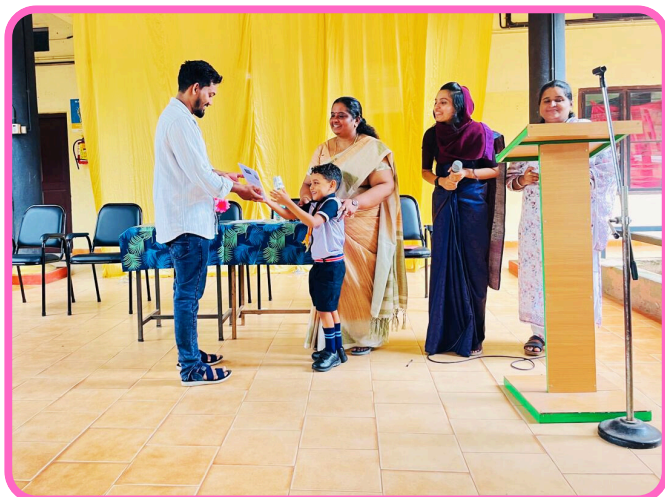
Celebrating Father's Day

Unconditional tenderness has been tasted by tiny blooms of kindergarten on 14th June when they enjoyed with their father's affection on Father's day. With much enthusiastic games, enticing songs, the tots handed over cards to their fathers expressing their love and affection. Various games including Zig zag race were conducted. To melodiously entertain the gathering, kiddies' fathers sing beautiful songs. The blissful day crafted the immortality of fatherly fondness at National Public School on Father's Day.