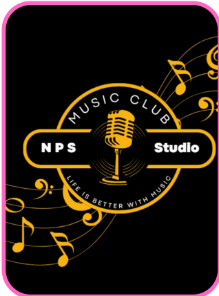
Music club inauguration and Logo launch