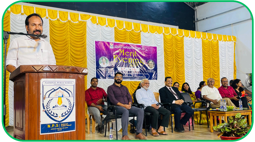
VSC Merit evening inaugurated by Sri.PC Vishnunath MLA and blessed by Dr.Alexander Jacob Former DGP,Kerala as guest of honour

Honoring brilliance and success at NPS on behalf of Venad Sahodaya Complex. National Public School hosted a grantevening to reward the elites of excellence from around thirty six schools of Venad Sahodaya Complex. Venad Sahodaya Complex is formed to promote and develop Social , Cultural, educational development among its schools to increase the skill and creativity in students to fall in with the present scenario. The meritorious evening was blessed with eminent dignitaries of Venad Sahodaya Complex which meant for the holistic development of students and schools. Rewards were procured by the students who scored outstanding results in X and XII classes of various schools on behalf of Venad Sahodaya Complex.