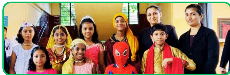
Procured Read and Win Award from Malayala Manorama