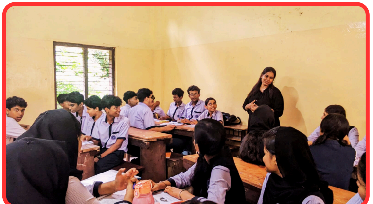
Communicative English training lead by Grace academy,Goa.