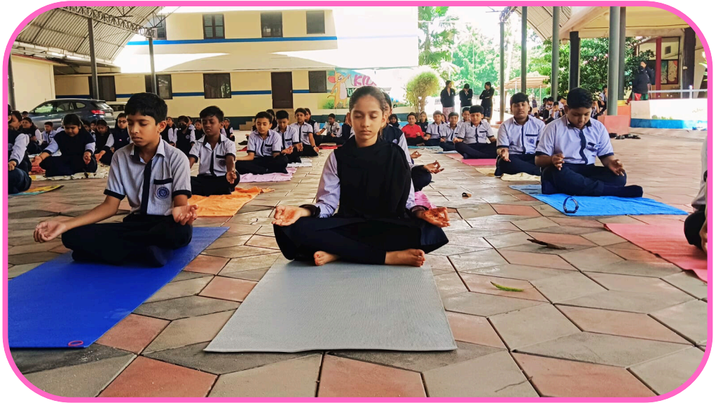
Students experiencing the sanctity of yoga

The day kick started with spreading freshness , purity, serenity and throwing light upon the physical, mental, and spiritual being of students as well as staff. It is highlighted in the session that practicing yoga would benefit our body and soul. It emphasized that yoga boosts up energy level, helps maintain health and improves body posture. Students were eager to be a part of the auspicious day when they experienced the sanctity of the day. Harmony of Body and Mind As part of Yoga day, several basic postures have been followed by the students.