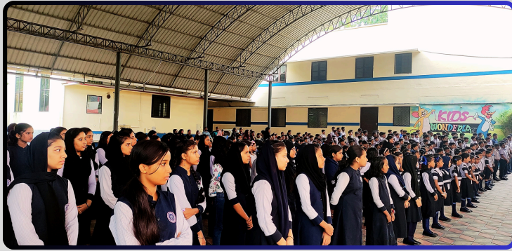
Reopening day assembly